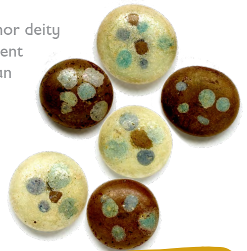
Gaming counters found with many other grave goods dug up at Lullingstone.

Tepidarium – ‘warm room’ in the bath suite.