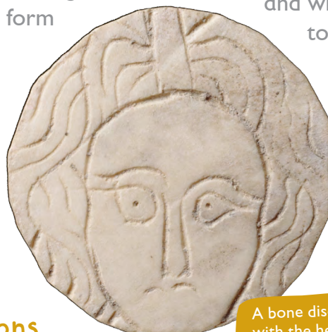
A bone disc carved with the head of Medusa, found in the mausoleum.