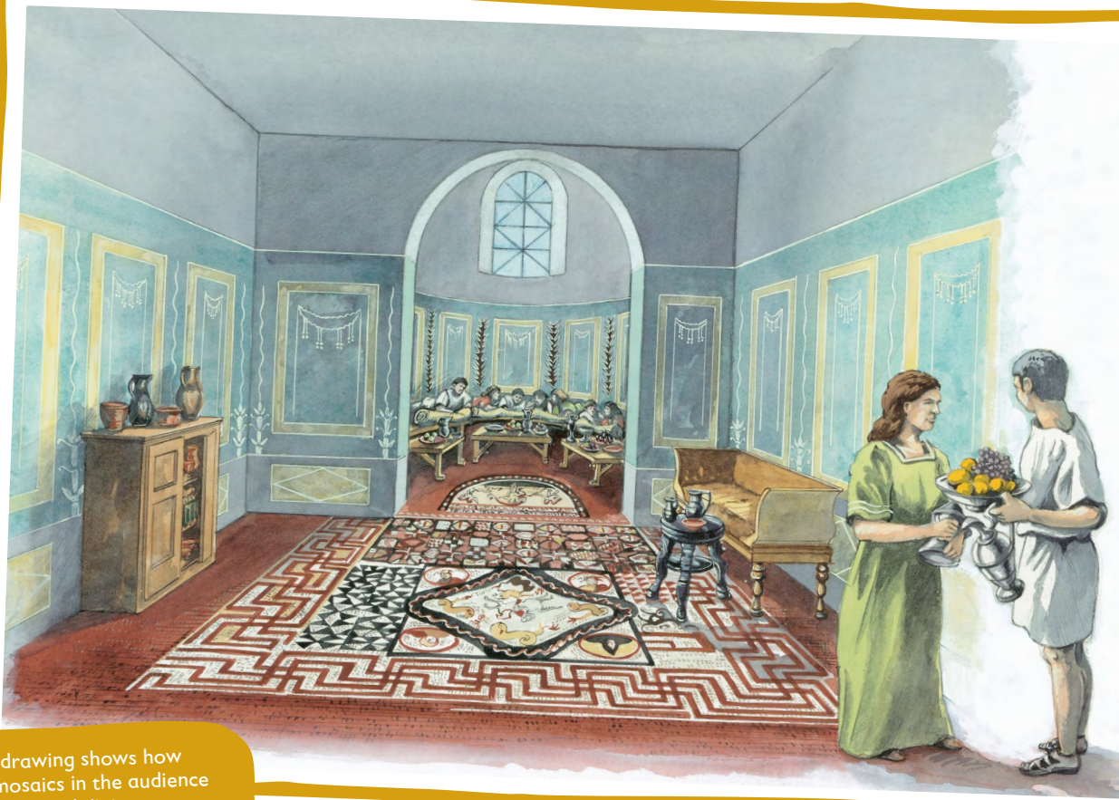
This drawing shows how the mosaics in the audience chamber and dining room may have looked in the 4th century.