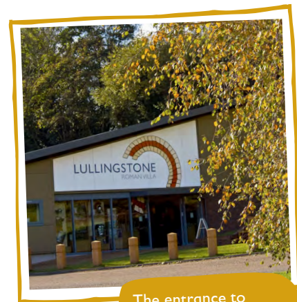
The entrance to Lullingstone Roman Villa today.