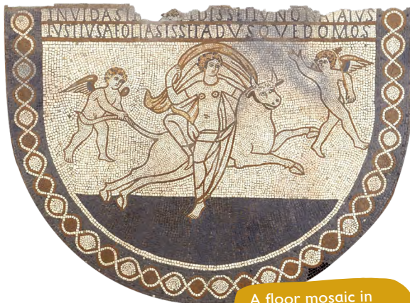
A floor mosaic in the dining room at Lullingstone showing the story of Europa.

Europa – a beautiful maiden in Ancient Greek mythology, most notable for her love affair with Zeus, the ruler of the Olympian gods. He notices her beauty and disguises himself as a white bull. Once she has climbed on the bull’s back, he charges away and kidnaps her.