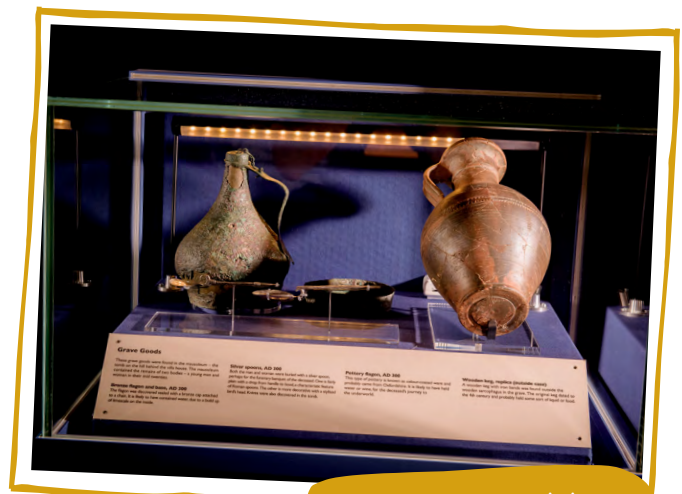
Bronze jug and ceramic jug on display. These were found in Lullingstone's mausoleum.

Despite the actions of grave robbers, an impressive range of grave goods was found with the burials. These included bronze and pottery flagons (used for serving drink), a glass bottle and bowls, two silver spoons, 30 glass gaming counters and a bone disc carved with the head of Medusa .