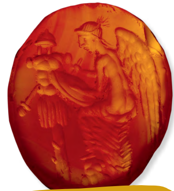
An engraved gemstone found at Lullingstone. Could it be from a ring belonging to Emperor Pertinax?

It has also been suggested that an engraved gemstone (cornelian intaglio), from a ring found at Lullingstone, was Pertinax's personal seal . Therefore, it is possible that the villa may have been his country residence.