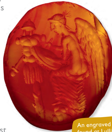
An engraved gemstone found at Lullingstone, possibly from Emperor Pertinax’s ring.

Cult – at Roman Lullingstone, ‘cult’ was the ‘care’ owed to pagan gods, practised through ritual and ceremony.